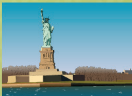
The Statue of Liberty