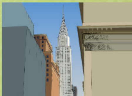
The Chrysler Building