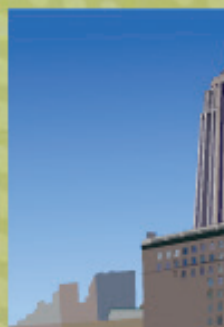
The Empire State Building